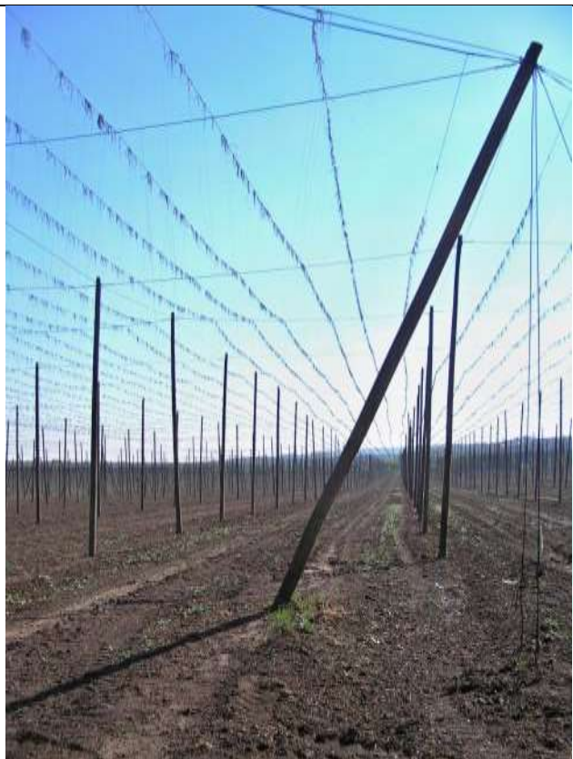
Production village Hrivice (location Woodland)