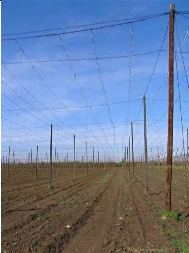
Production village Rocov (location Woodland)