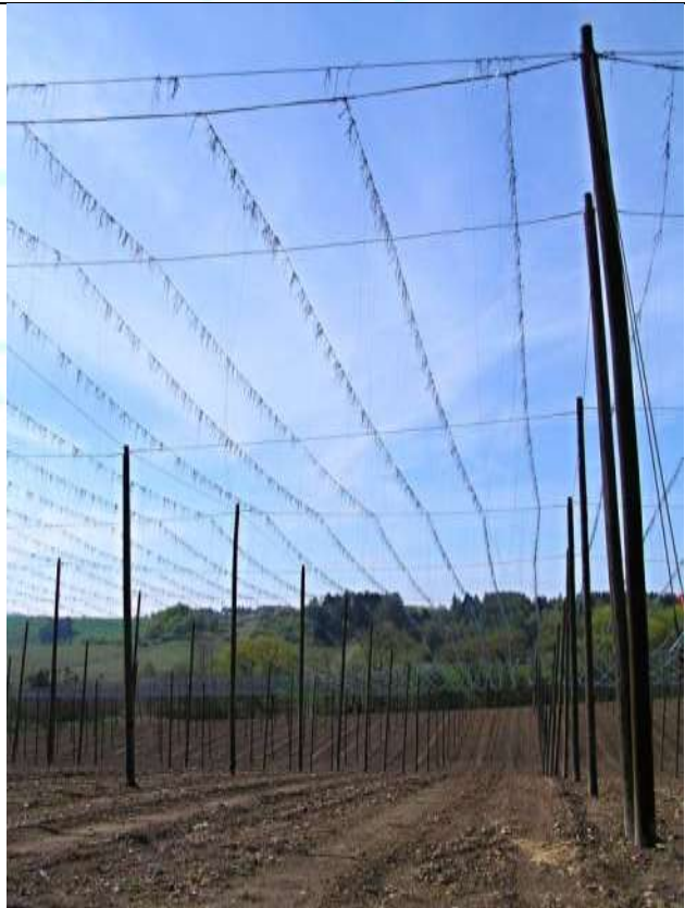
Production village Kroucova