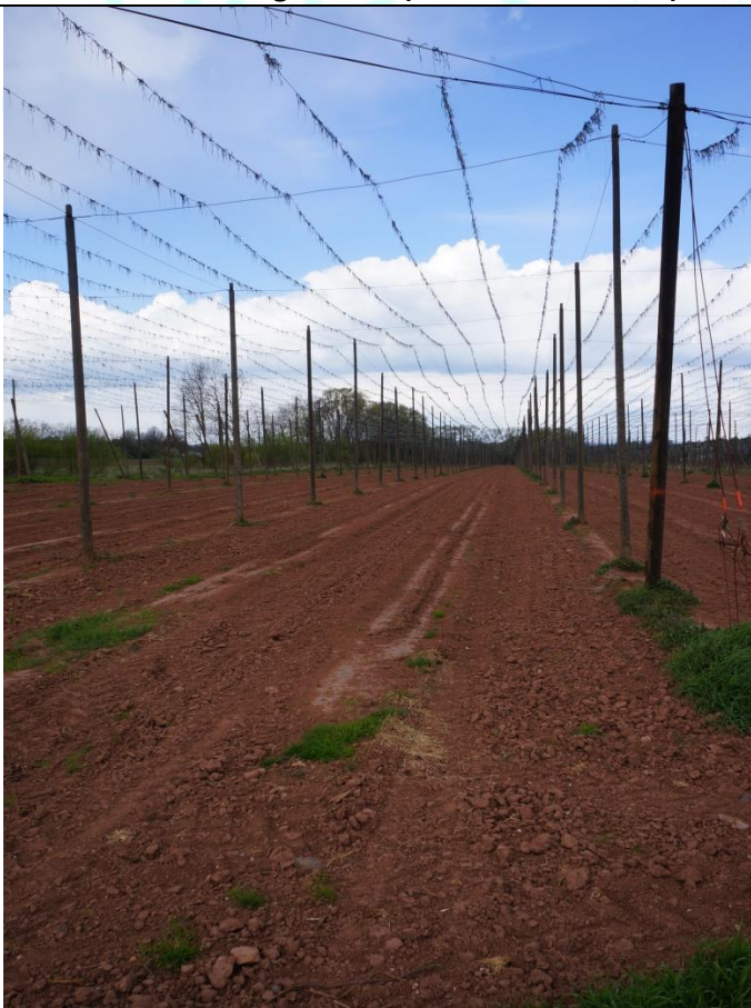
Production village Zelec (location Golden Creek Valley)