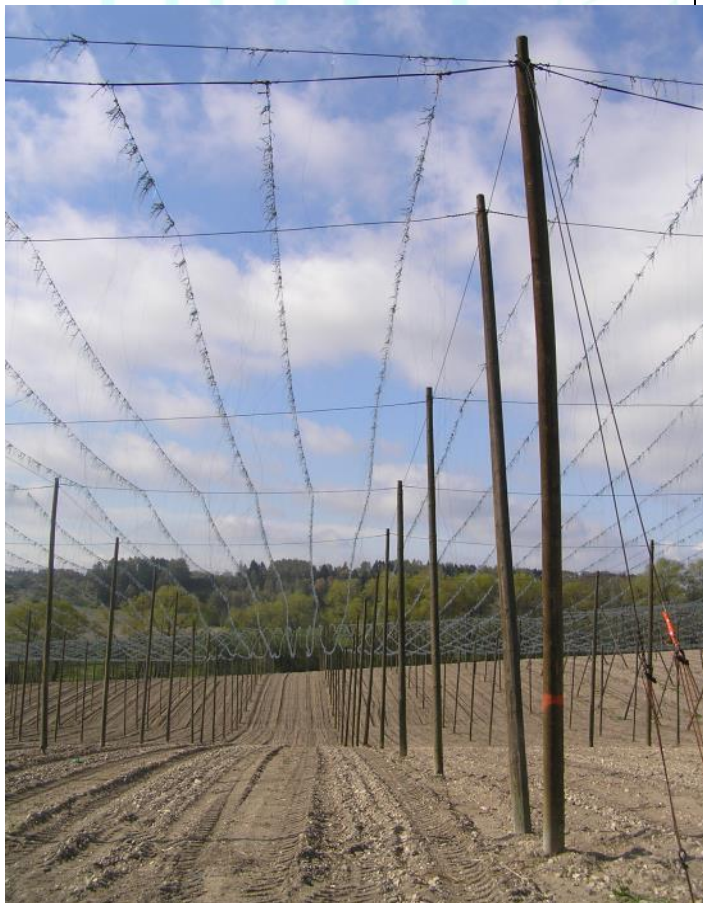
Production village Kroucova