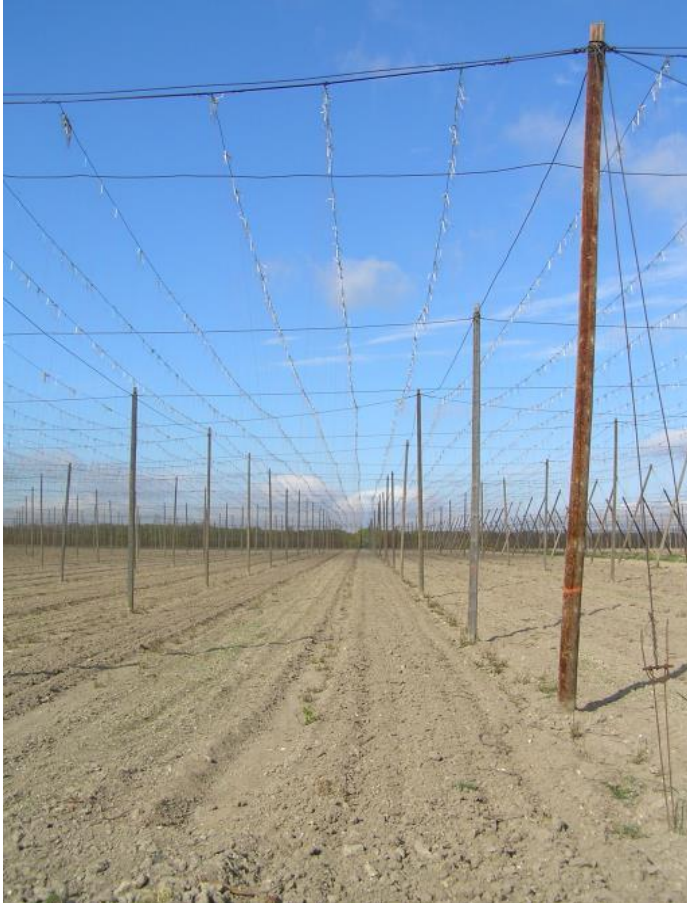
Production village Rocov (location Woodland)