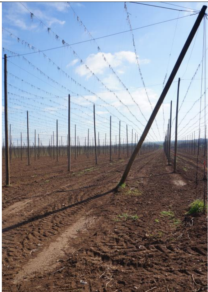
Production village Hrivice (location Woodland)