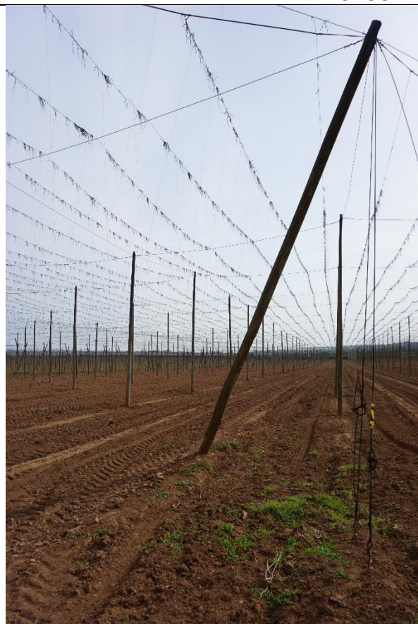
Production village Hrivice (location Woodland)