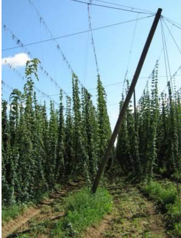
Production village Hrvice (location Woodland)