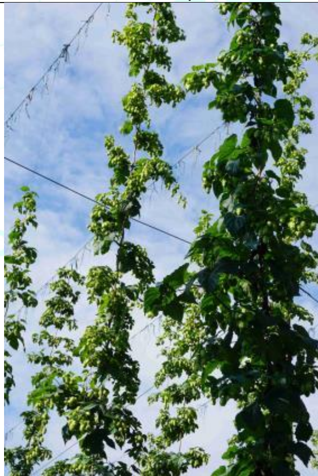
Focus on the plant