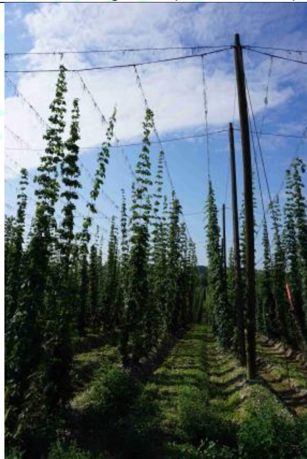
Production village Kroucova