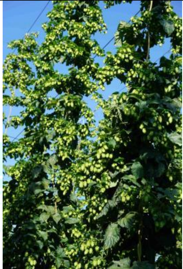
Focus on the plant