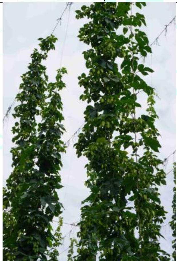
Focus on the plant