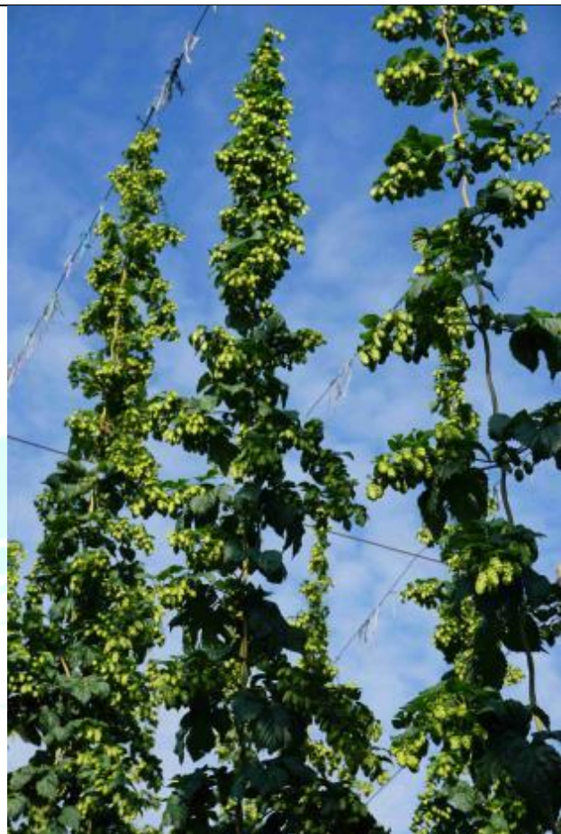
Focus on the plant