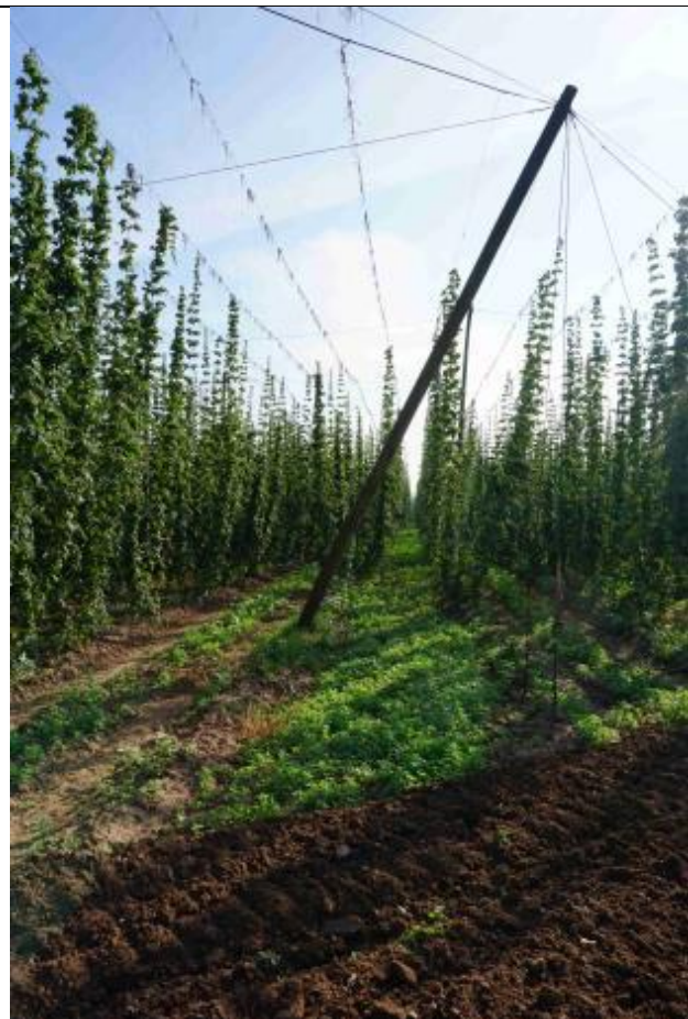
Production village Hrivice (location Woodland)