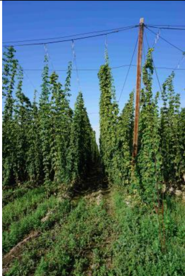
Production village Rocov (location Woodland)