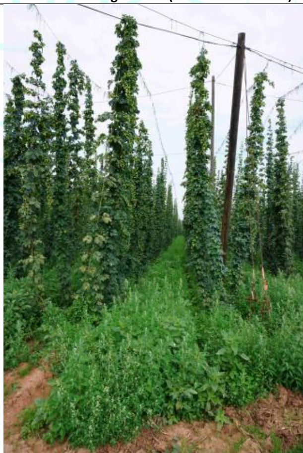
Production village Zelec (location Golden Creek Valley)