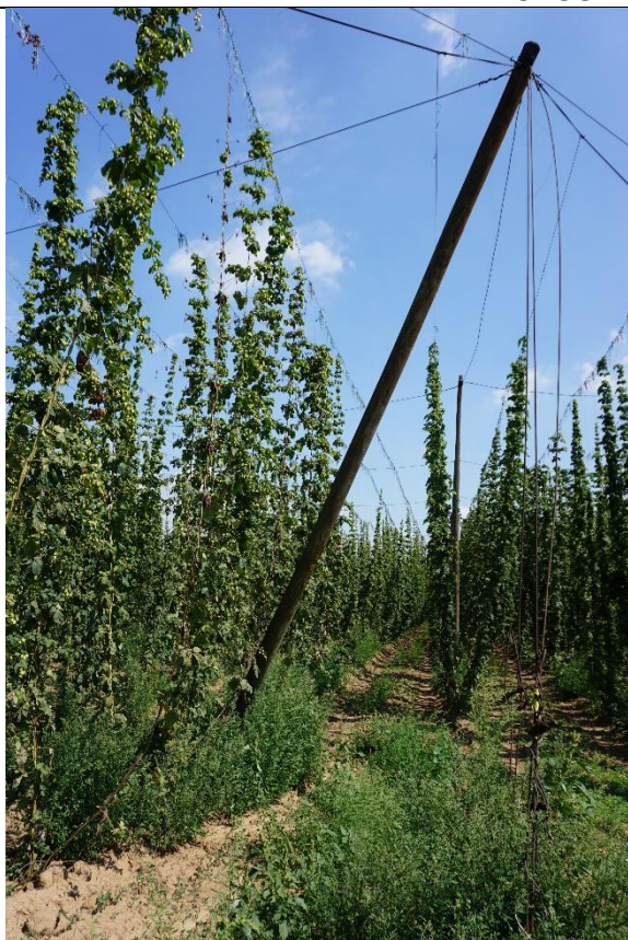
Production village Hrvice (location Woodland)