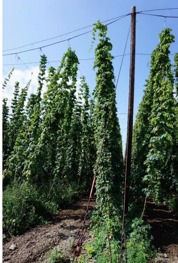
Production village Rocov (location Woodland)