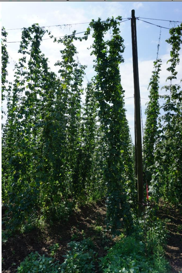
Production village Kroucova