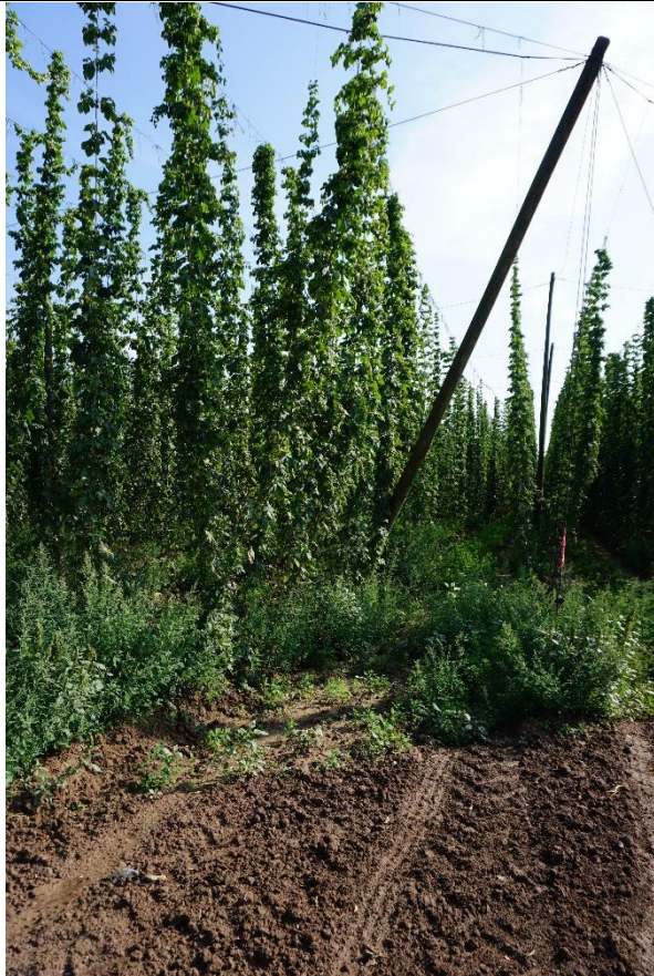
Production village Hrivice (location Woodland)