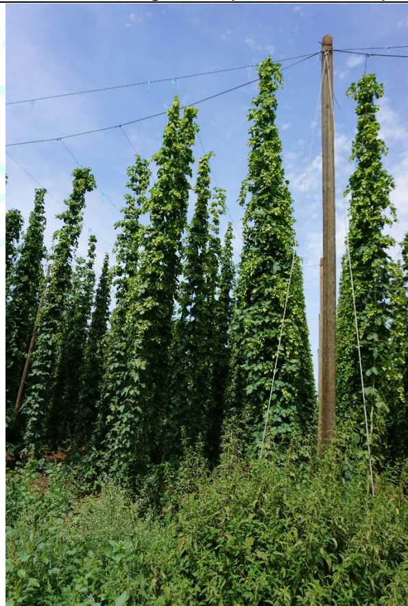
Production village Zelec (location Golden Creek Valley)