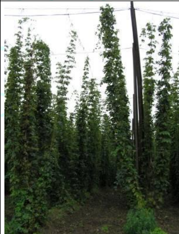
Production village Kroucova