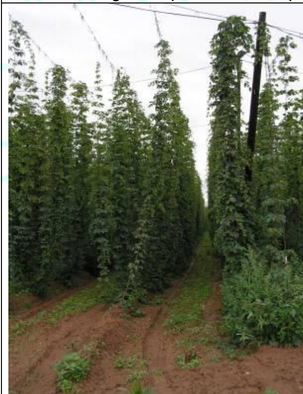
Production village Zelec (location Golden Creek Valley)