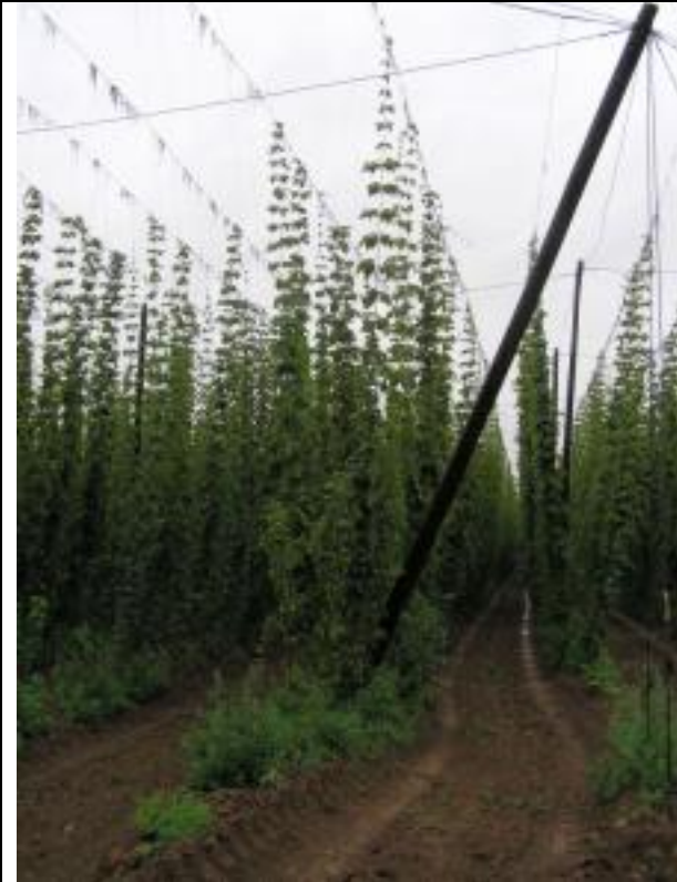
Production village Hrivice (location Woodland)