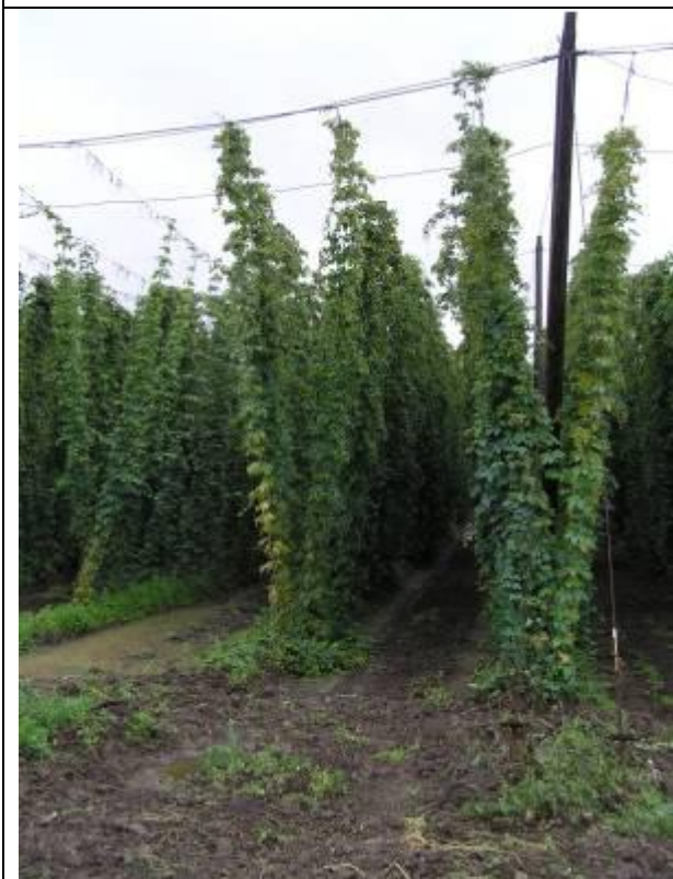
Production village Rocov (location Woodland)