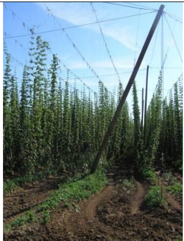
Production village Hrivice (location Woodland)