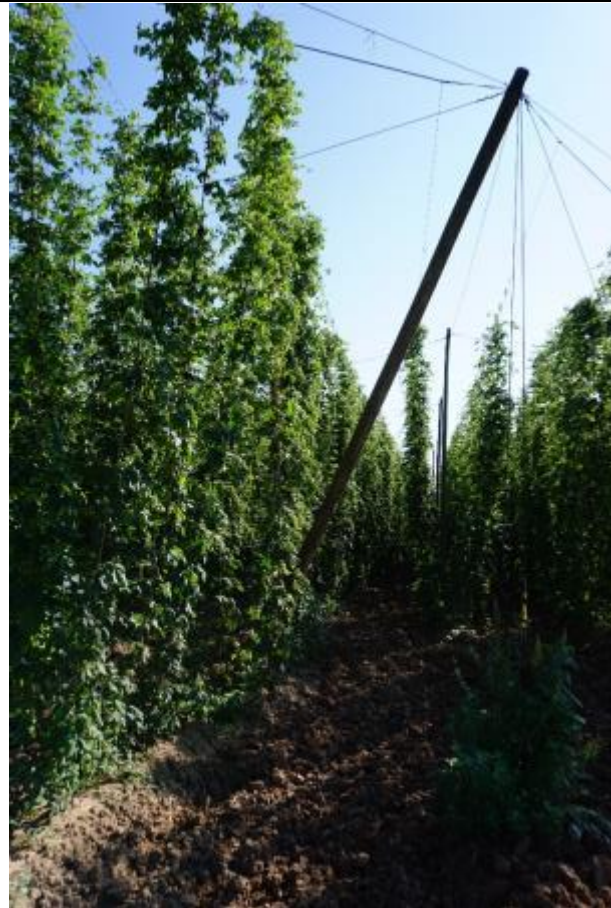
Production village Hrivice (location Woodland)