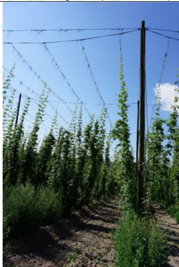
Production village Kroucova (location Woodland)