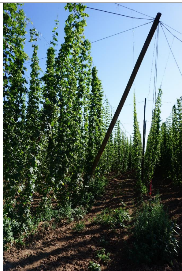
Production village Hrivice (location Woodland)