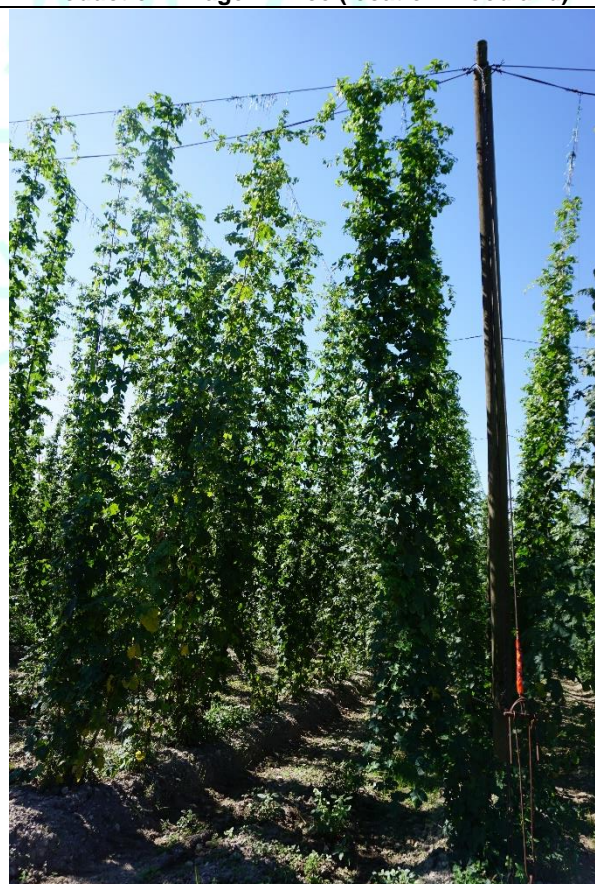
Production village Kroucova