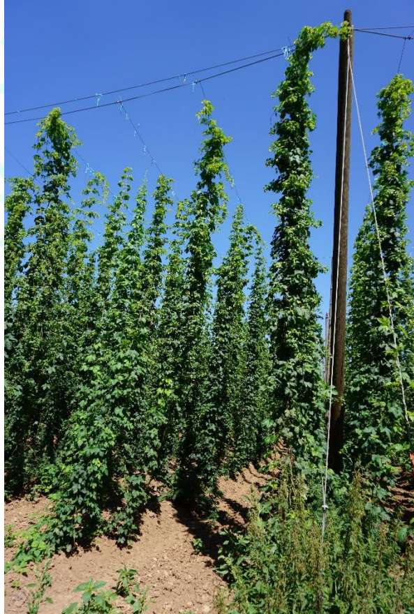
Production village Zelec (location Golden Creek Valley)