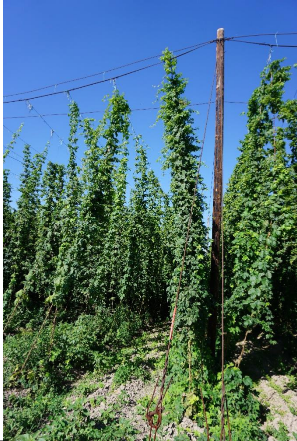
Production village Rocov (location Woodland)