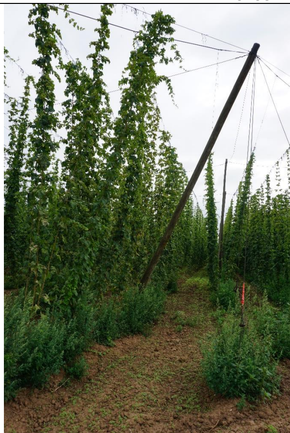
Production village Hrvice (location Woodland)