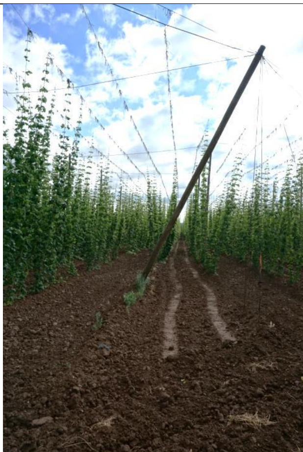
Production village Hrvice (location Woodland)