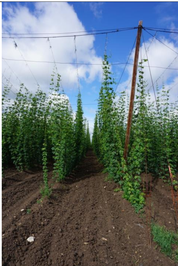
Production village Rocov (location Woodland)