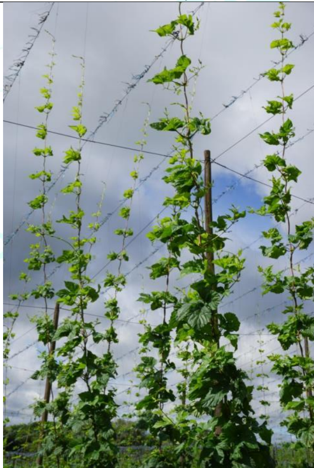
Focus on the plant