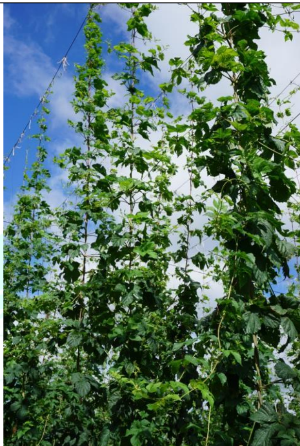
Focus on the plant