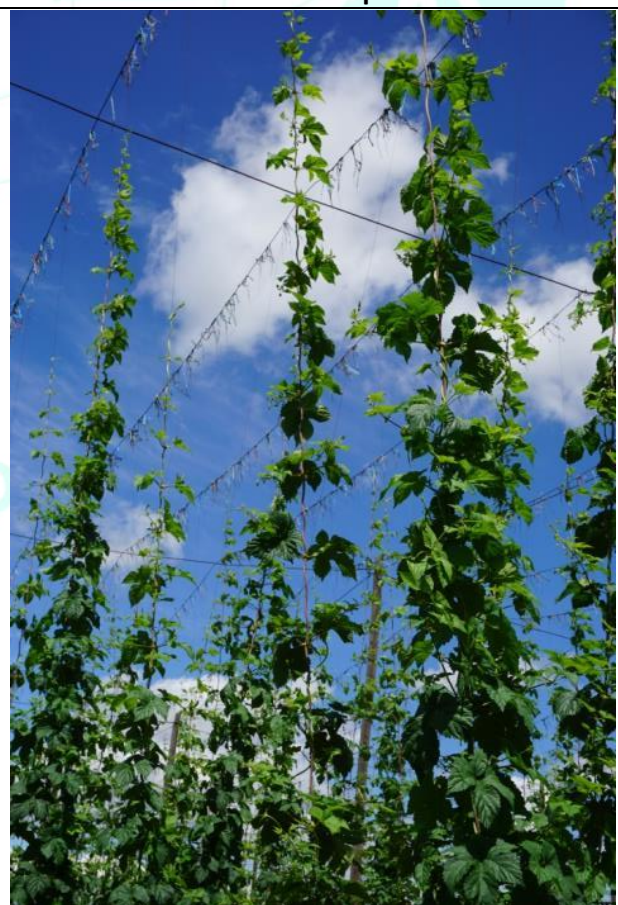
Focus on the plant