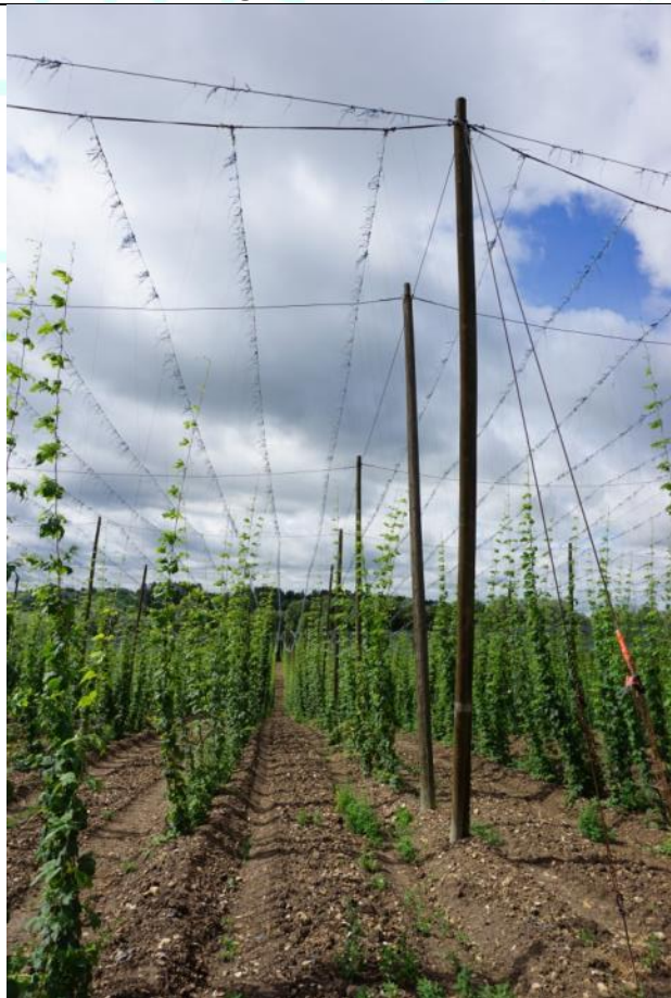
Production village Kroucova