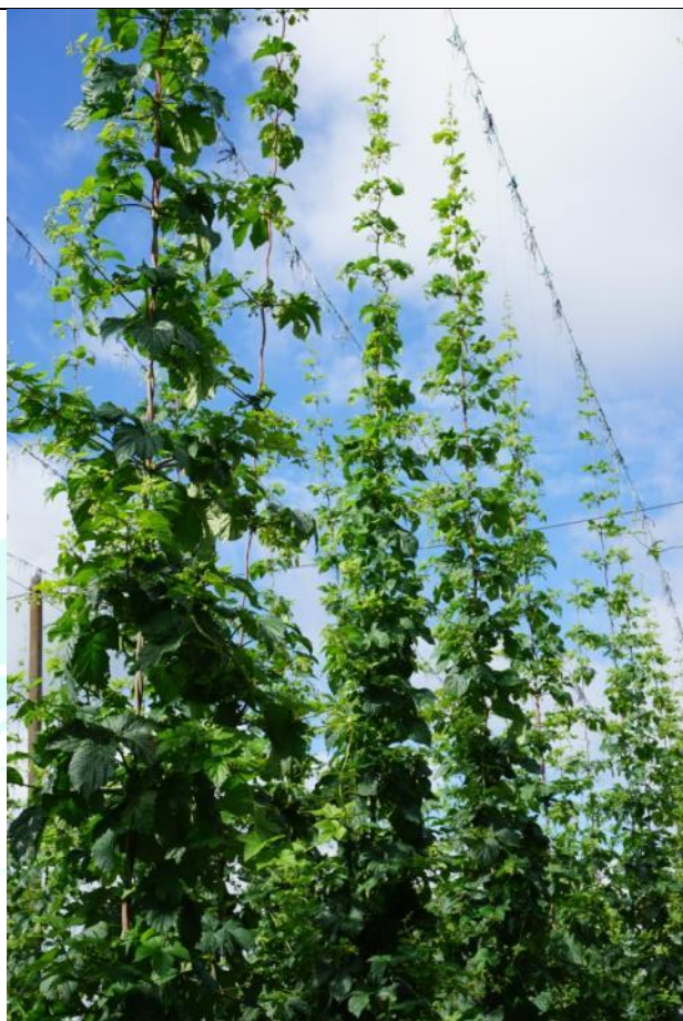
Focus on the plant