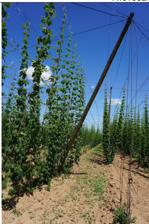
Production village Hrvice (location Woodland)