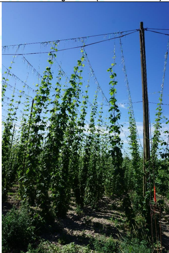
Production village Kroucova