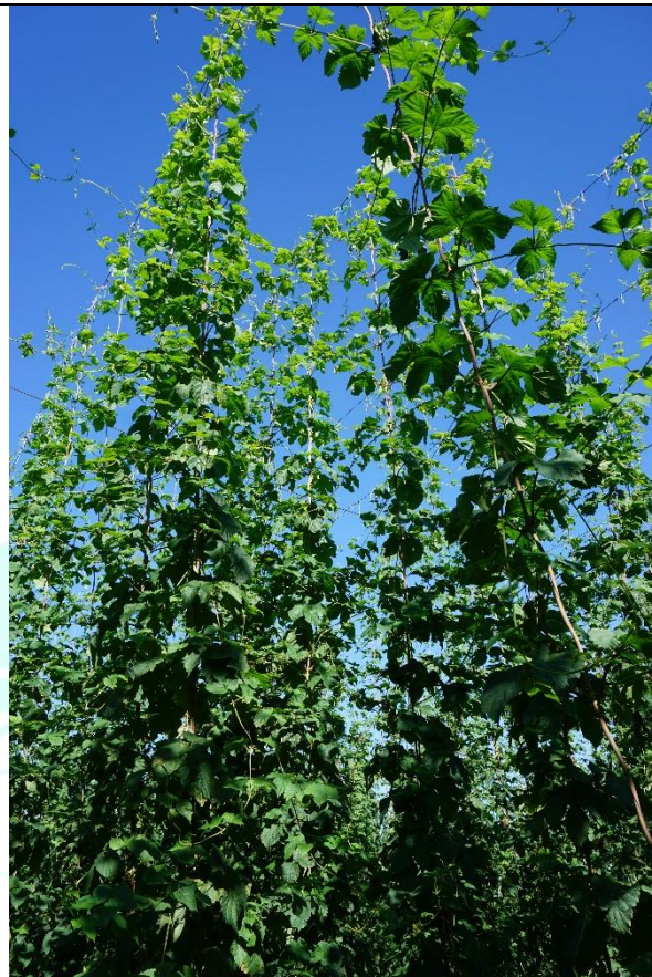
Focus on the plant