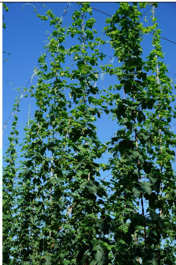
Focus on the plant