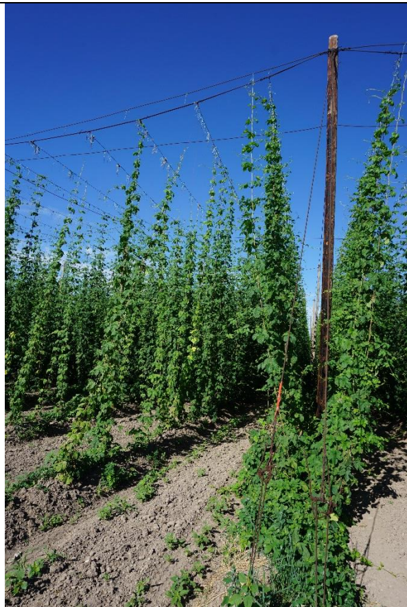
Production village Rocov (location Woodland)