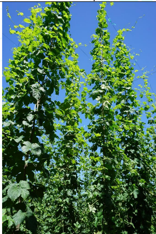
Focus on the plant