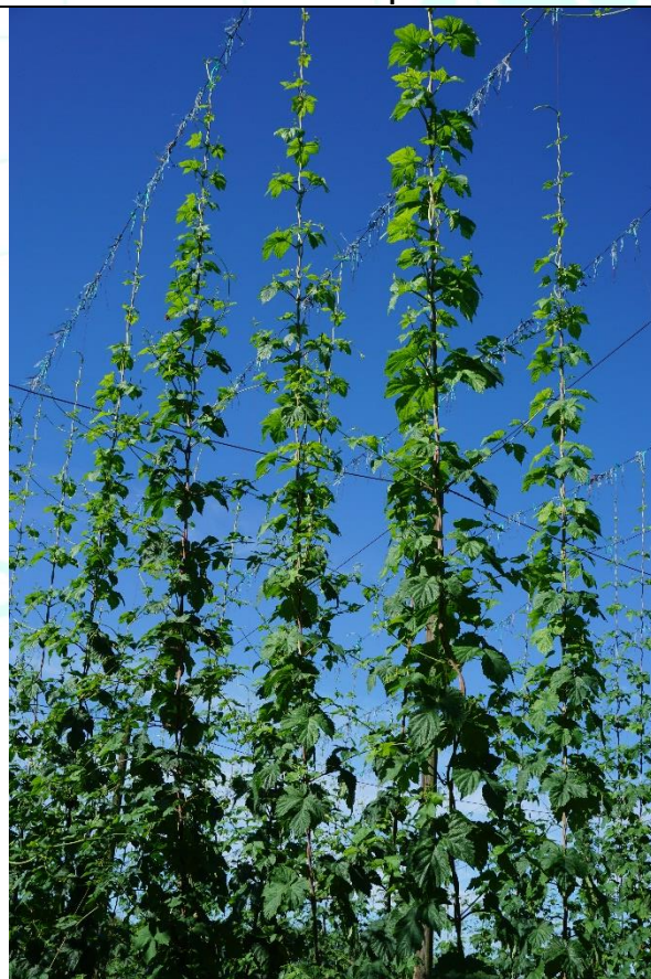
Focus on the plant