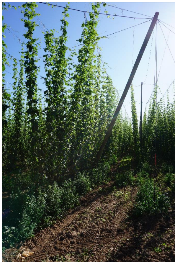
Production village Hrvice (location Woodland)