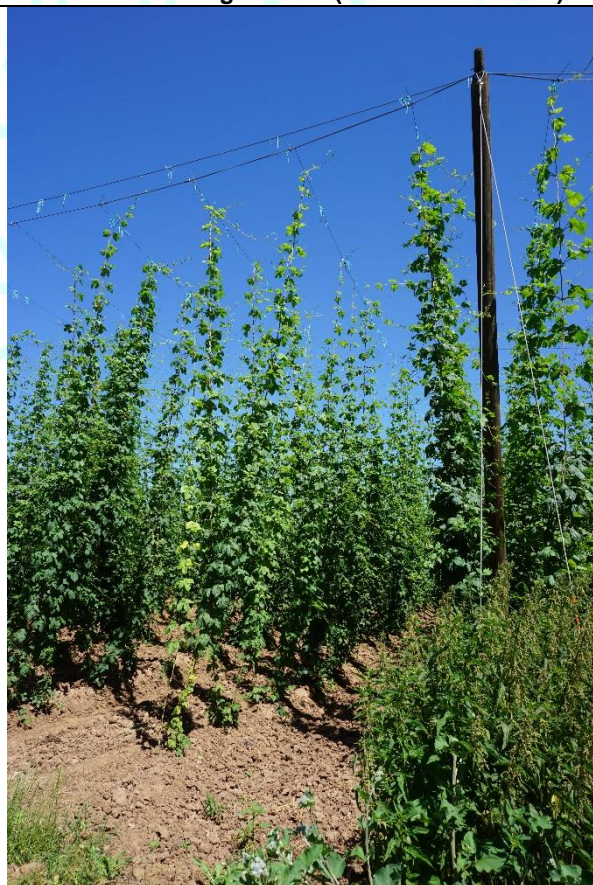
Production village Zelec (location Golden Creek Valley)