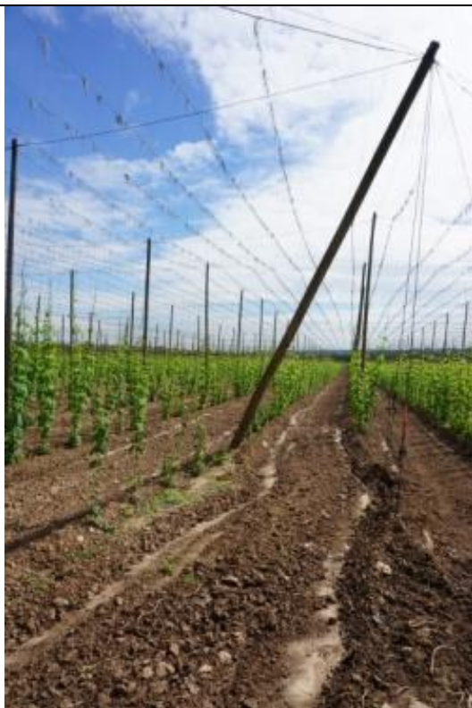
Production village Hrvice (location Woodland)