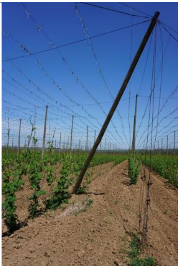
Production village Hrvice (location Woodland)