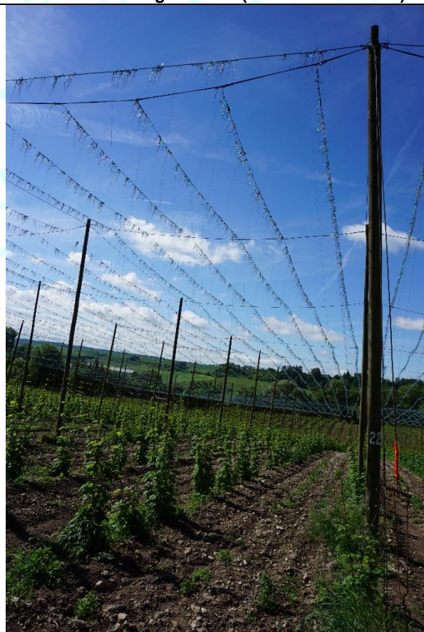
Production village Kroucova