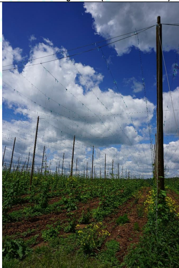
Production village Zelec (location Golden Creek Valley)