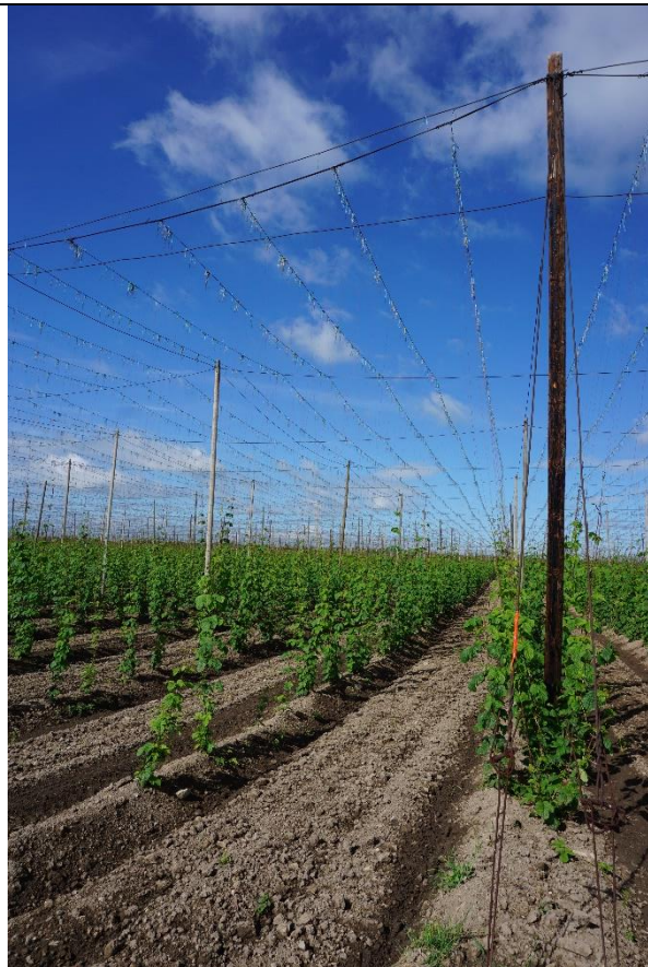
Production village Rocov (location Woodland)