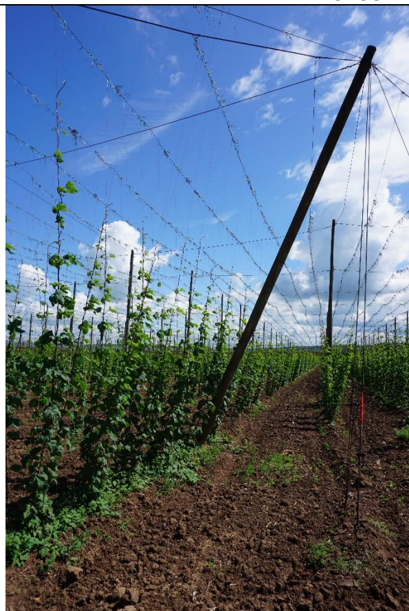
Production village Hrvice (location Woodland)